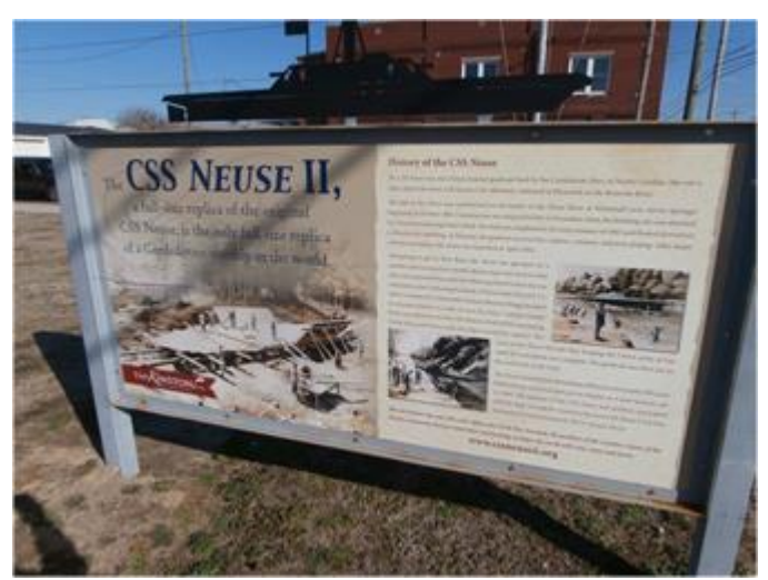
CSS NEUSE II in Kinston NC. 158 Foot full size replica