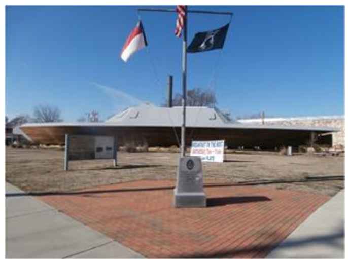
CSS RAM NEUSE IRONCLAD – Serving breakfast on the boat!