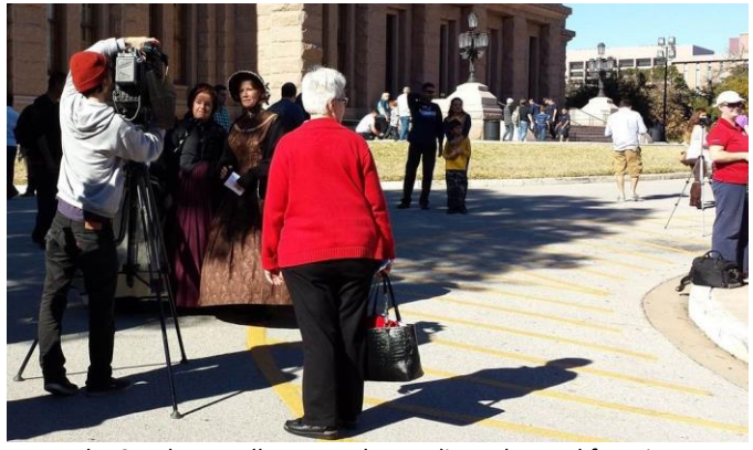
The Southern Belles were the media and crowd favorites