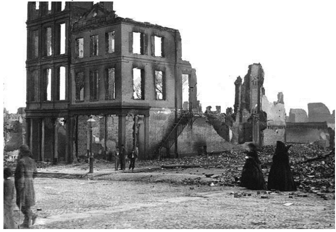
Aftermath of the burning of Richmond

The next day, April 3<sup>rd</sup> Confederate soldiers set fire to tobacco warehouses. The fires spread throughout the commercial heart of the city, leaving nine-tenths of the business district in ruins. Although the fires were started by the Confederates the damage was chronicled in dramatic images made by Union photographers eager to capture the devastation, and to give a graphic representation of the punishment being endured by the defeated foe.