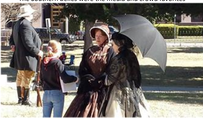
Continued Next Page