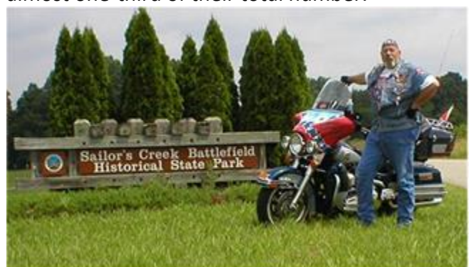
DCV TRAVELLER Editor's Motorcycle Trip to Virginia

On April 6<sup>th</sup> approaching Farmville, Lee's troops inadvertently diverge into two segments, each heading off in different directions allowing the Federals to strike the divided forces at Saylers Creek completely overwhelming both wings. At the cost of 1180 men the Federal forces captured close to 8,000 Confederates which amounted to almost one-third of their total number.