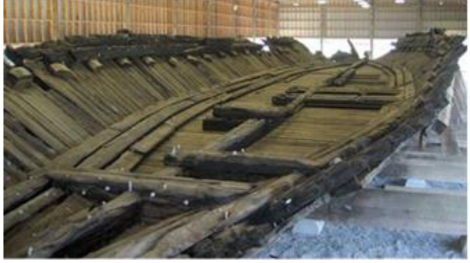
Along with the hull nearly 15,000 artifacts were recovered from the site and are on display in the Interpretive Center

To avoid capture the CSS NEUSE was burned and scuttled in the Neuse River at Kinston, NC by its crew the night of March 10, 1865. Almost 100 years later the hull was raised and in 1963 placed on display. In 2012 it was moved to the new CSS NEUSE Interpretive Center in Kinston, NC.