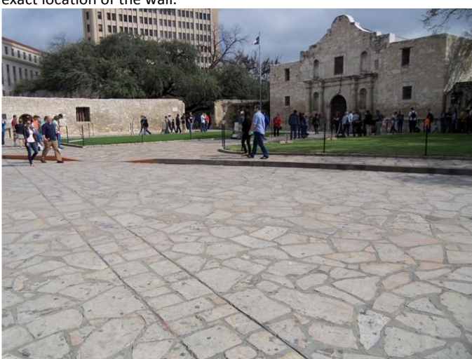
Parallel lines in the stone mark the location where a perimeter wall leading to the long barracks stood during the siege of the Alamo.