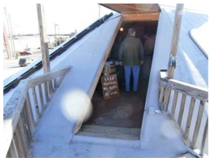
Hatch to the Mess Deck