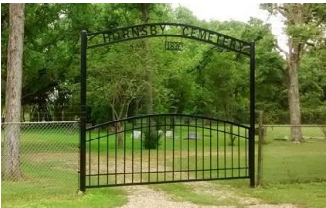
Hornsby Cemetery Established 1836