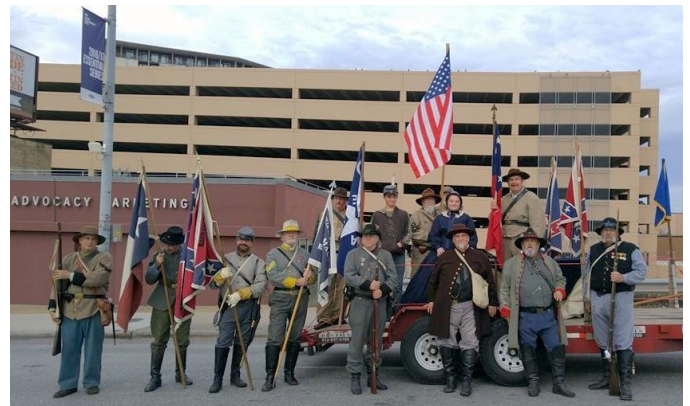
Austin Veterans Day Parade 11-11-16

Footnote: I'm sure it was by her choice that the County Judge was MIA again this year from the VIP viewing balcony on the Stephen F. Austin Hotel.