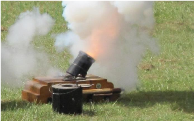
DEFIANCE takes a parting shot!